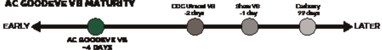
AC GOODEVE VB MATURITY

BREEDER: R.M. DEPAUW, AAFC SWIFT CURRENT PARENTAGE: 94B43-BLW4/AC INTREPID